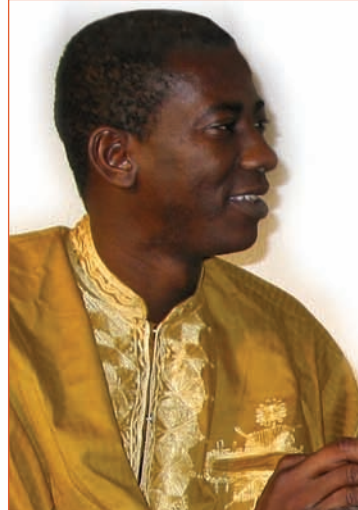
Cora player from West Africa